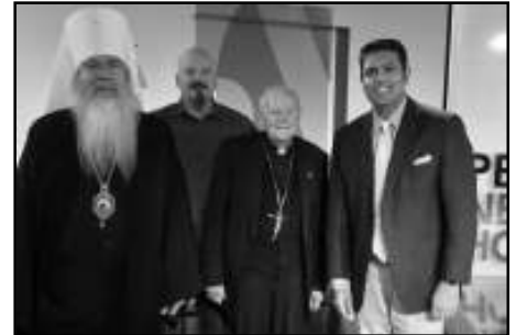
Metropolitan Tikhon with Cardinal Theodore McCarrick and PBS staff on News Hour set.